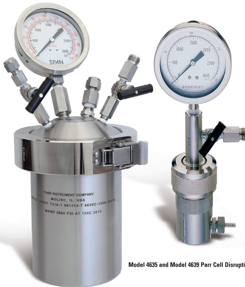
Model 4635 and Model 4639 Parr Cell Disruption Vessels

The larger vessels, 4636, 4637, and 4638, are intended for large volume applications. Users are urged to run preliminary experiments in the 4635 Vessel to confirm the suitability of the procedure before scaling up to these larger sizes.