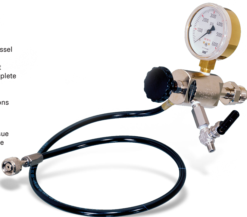
1831 Nitrogen Filling Connection

Instead of pouring the cell suspension directly into the vessel cylinder, most users will find it convenient to hold the sample in a beaker or test tube which can be placed inside the larger vessels. A supplementary container is particularly useful when working with small samples. As a general rule, the capacity of the inner container should be approximately twice the volume of the suspension to be treated. Larger samples may, of course, be poured directly into the cylinder. If an inner container is used, it must be positioned so that the dip tube leading to the release valve reaches to the very bottom of the container. Plastic test tubes, centrifuge tubes and beakers work well as auxiliary sample holders. They are not only unbreakable but they also can be floated on ice water within the vessel to keep the suspension cool during equilibration and to bring the bottom of the sample holder up to the tip of the dip tube to ensure complete sample recovery.